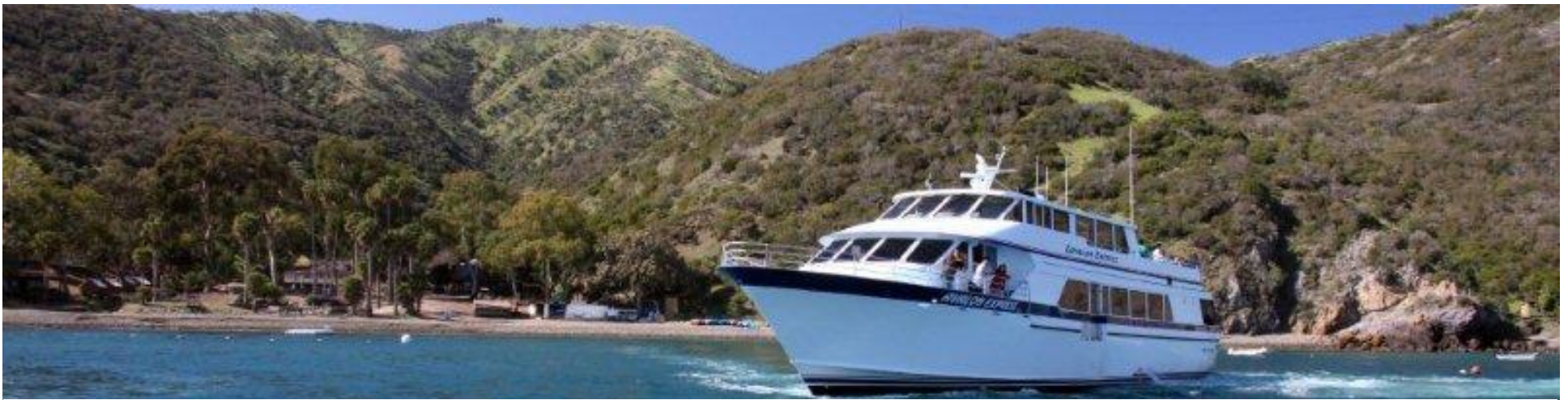
Private Charter by Catalina Express Delivers and Picks Up Groups (Over 100) from Camp's Private Pier