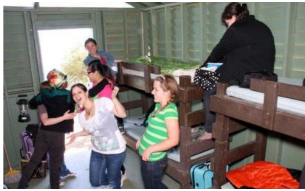
Open Air Cabins