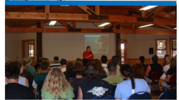
CBS Crow's Nest Meeting Facility exterior and interior (seats up to 145) w/sound & video