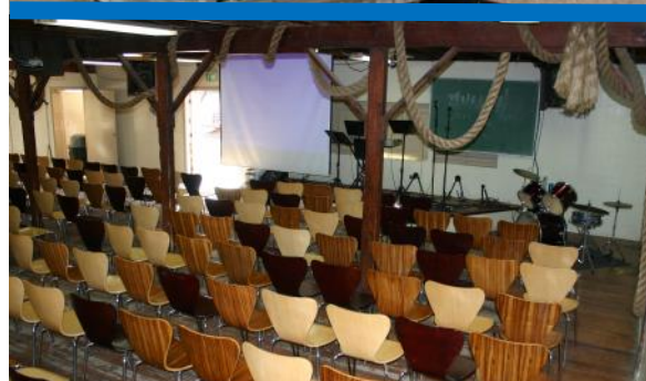
CBS Main Deck Meeting Facility exterior and interior (seats up to 240) w/sound & video